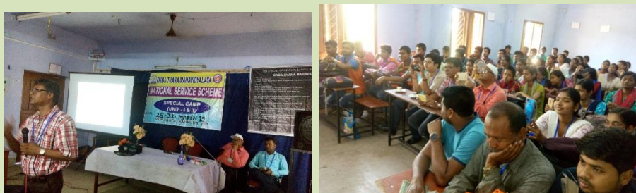
Discussion on tobacco

perform a short play on the harmful aspect of tobacco. The invitees highlighted its horrors through a power point presentation. A total of 68 volunteers and 6 teachers took part in the programme.