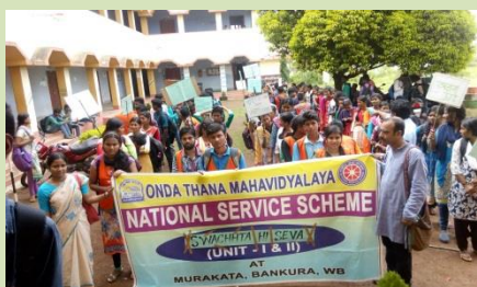
The rally and village visit