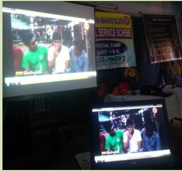
PPT on the harmful effects of tobacco volunteers