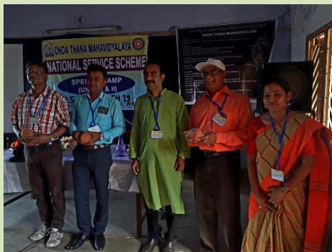
P.O. with Bankura Tobacco Cell