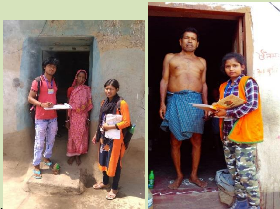
Village Survey at Dhabani

4 th day of NSS special camp (28.03.18): On the 4 th day NSS volunteers visit the adapted villages Dhabani and Bheduasole and conduct surveys. They collected data on child marriage, school dropout, using toilets at home, using tobacco, drinking alcohol and percentage of people using chemical fertilizers on land. And they warned the villagers about the same.