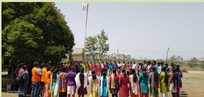
Hoisting of NSS Flag

Date -24.09.2018 On 24 th September 2018, all the Units of NSS of Onda Thana Mahavidyalaya celebrate the NSS Day in a gorgeous way on that day volunteers of NSS requested all the students and staff of our college to come in the Seminar room. There our Principal Sir gave a valuable lecture on the importance and relevance of NSS in our college in general and in the society in particular. A total of 70 volunteers and 8 teachers took part in the programme. The ceremony ended with the distribution of packets of sweets.