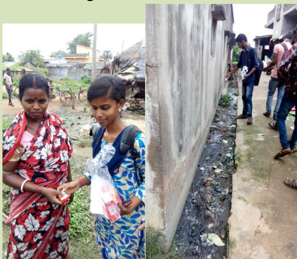
Soap distribution and spread bleaching.