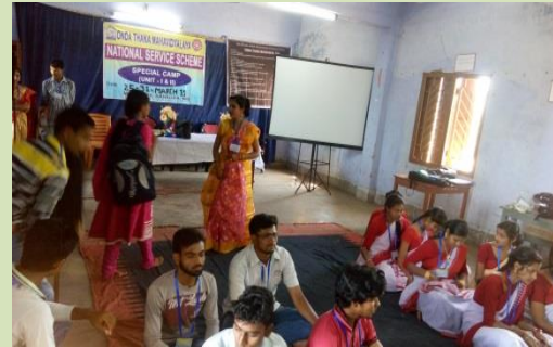
open theatre by