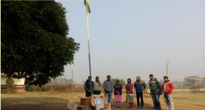
Flag hoisting on the Birthday of Netaji Subhash Chandra Bose

staff of our college also planted trees and watered them. Some of them also reminded the students to nurture the trees regularly and to carry on their duty unless the saplings become self-dependent. Total 56 volunteers and 7 teachers took part in the programme. When the program ends, the packets of tiffin cake were distributed.