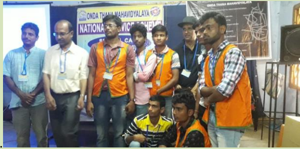
Volunteers with experts

4 th day of NSS special camp (28.03.18): On the 4 th day NSS volunteers visit the adapted villages Dhabani and Bheduasole and conduct surveys. They collected data on child marriage, school dropout, using toilets at home, using tobacco, drinking alcohol and percentage of people using chemical fertilizers on land. And they warned the villagers about the same.